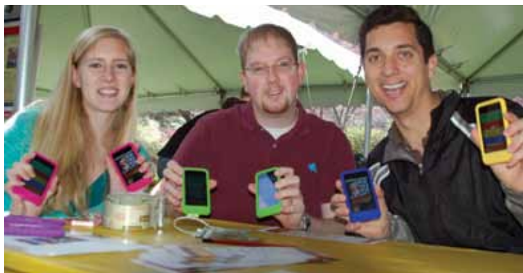
Students who helped develop the mobile platforms course display their work at VEISHEA.