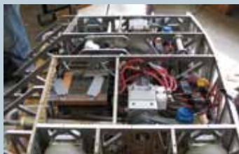
The ISU team's robot named Dark Cyde placed among the top eight teams.