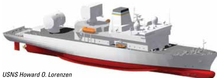
USNS Howard O. Lorenzen