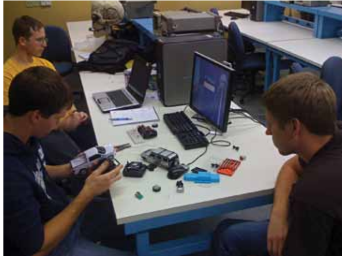
Students in the Electrical Engineering Learning Community and EE 185 class

Every year, freshmen in electrical engineering are greeted with a simple question and this year was no different. Their answer to the question? “Yes, we’re ready to be shocked.” •